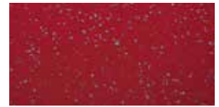
ME 21 Bright Red