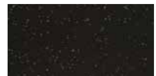
ME 16 Black