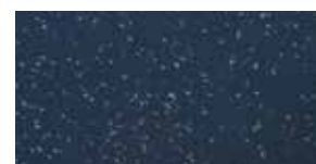
ME 10 Blue