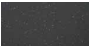
ME 04 Dark Grey