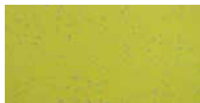
ME 12 Lime Green