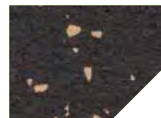
10104 Titan Tan