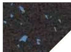
10102 Jayz Blue