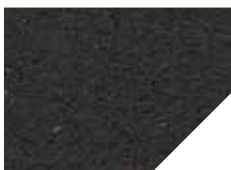
10100 Jet Black